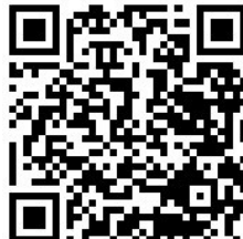
PANTRY SIGN UP