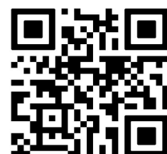
WEEKLY FAST FACTS